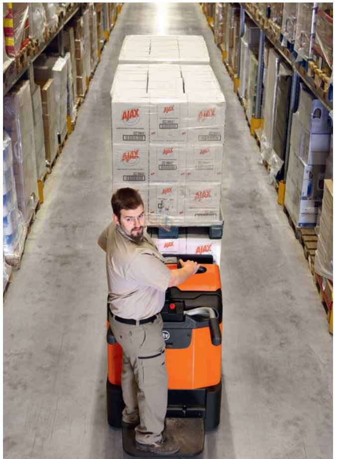
P-series, 2400 kg