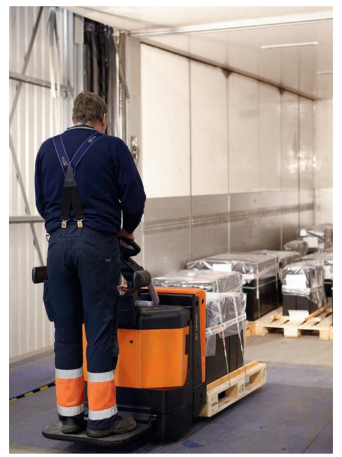
P-series, 2000 kg