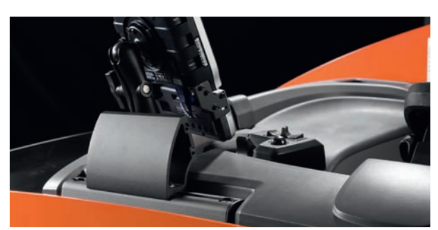
The E-bar universal mount for warehouse management devices such as PCs, terminals, bar code readers