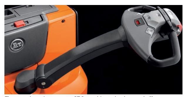
The control arm incorporates BT Powerdrive technology and offers easy, intuitive operation

The 2000 kg model (LWE200) can be specified with flip-down operator platform for applications demanding longer travel distances.