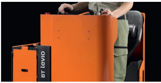
All S-series models offer excellent protection for the operator