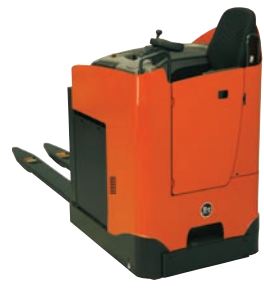
R-series 2000 kg–3000 kg