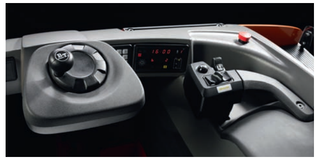
360° steering ensures maximum manouevrability and control with minimal effort

Performance parameters can be programmed and easily selected upon start-up. Access is contralled with PIN codes, restricting operation to only authorised drivers. Electronic regenerative braking is programmable to suit the driver – when accelerator is released, and/or when change of travel direction is applied.