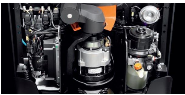
The fixed motor has no moving cables