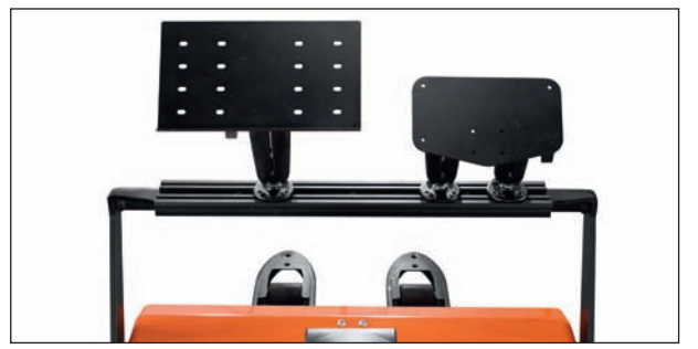
All models are available with the E-bar mounting rail for ancillary equipment such as writing tables and shrinkwrap holders. It can also incorporate a power supply for items such as PCs, radio-data terminals and barcode scanners.