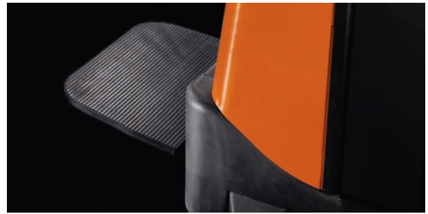
BT Levio P-series models' flip-down platforms aid productivity in long distance applications without compromising manouevrability

Another concept invented by BT – the P-series' Powertrak chassis – automatically adjusts the drive wheel pressure to suit the load, thereby increasing traction and virtually eliminating wheelspin.