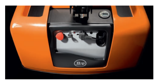
The emergency stop button and the lead for the built-in charger are easily accessible to the operator

The LWE130 features the unique BT Castorlink system for optimum stability. The castor wheels rotate within the truck's body profile, providing added safety for the driver and load.