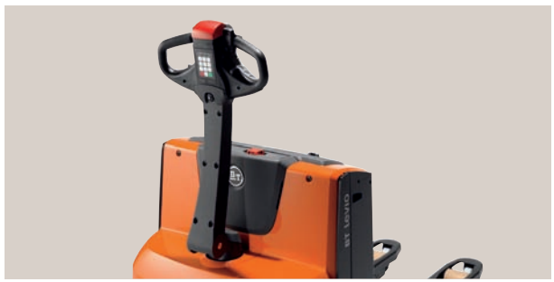
The Click-2-Creep function allows the truck to be manoeuvred with the handle upright