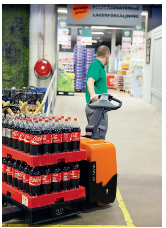
W-series, 1300 kg