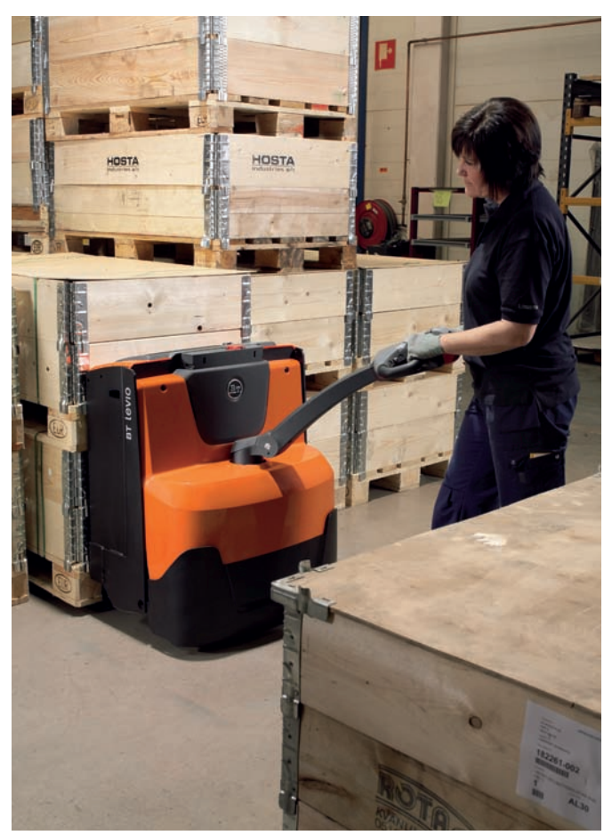
W-series, 1800 kg