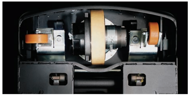
The LWE130 has a five-point chassis for optmum stability and control, with castors that rotate within the profile of the truck