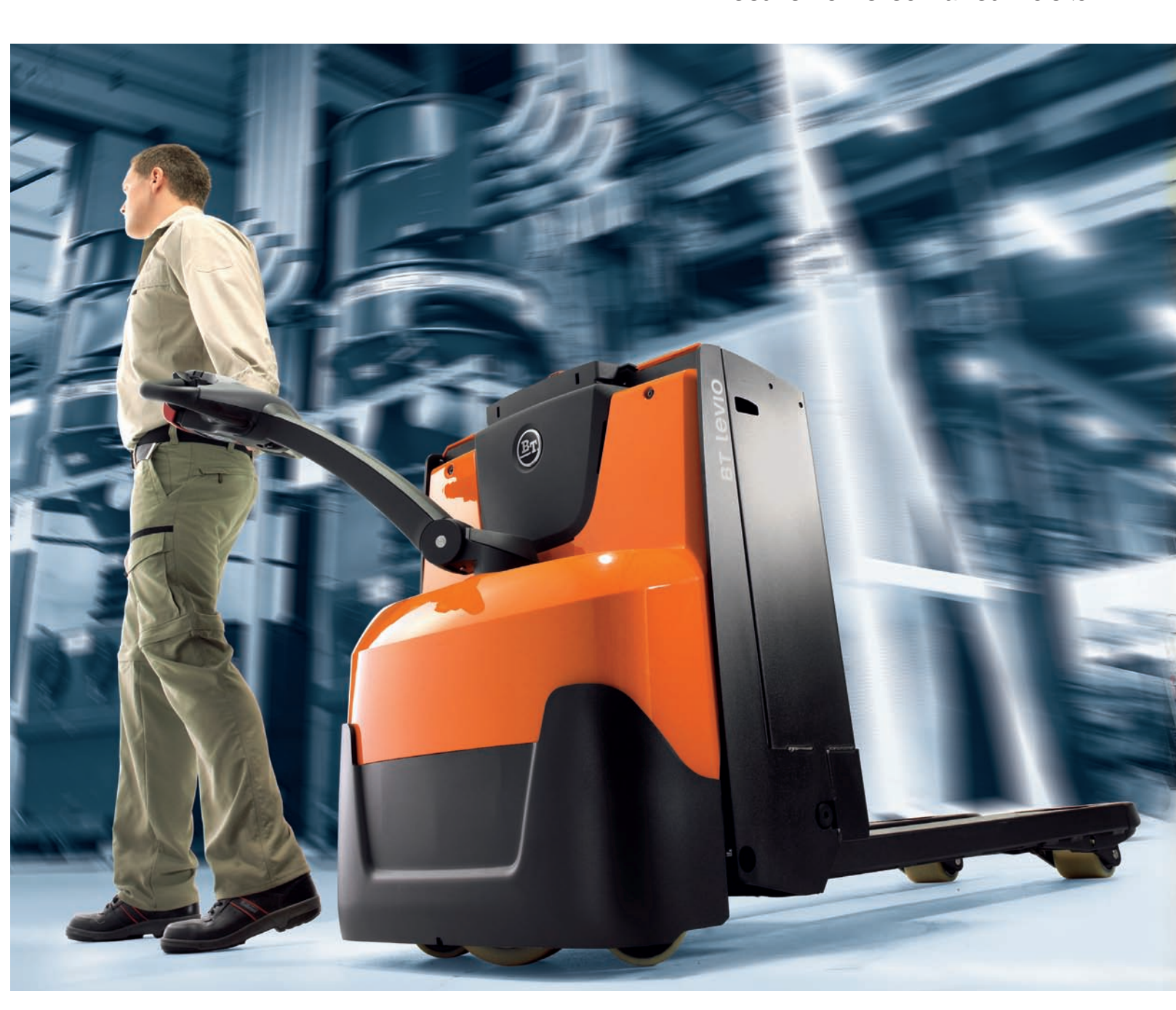
1.3 – 3.0 tons Electric Powered Pallet Trucks