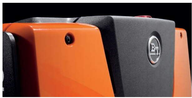
The hood is secured by two bolts for fast access

In line with this philosophy, the W-series' AC drive motors have fewer wearing parts than DC equivalents and many of the truck's bushings are made of a Teflon-coated composite material that improves their working life and eliminates the need for greasing. Sealed connectors, non-contact switches, leak-free hydraulic connectors and CAN-Bus wiring all add up to maximum reliability. BT Levio W-series is designed to be serviced only once a year in typical single-shift operations.