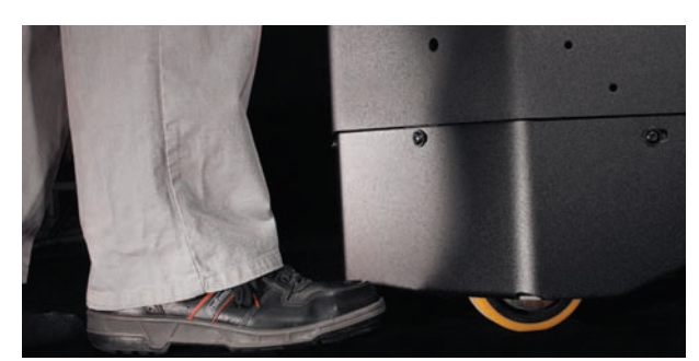
The P-series' low skirt protects the operator's feet without impeding access to ramps and gradients

All BT Levio trucks are built with the highest quality components. For example, all bushings on the LPE240 are constructed from bronze, with lubrication points, for a long and reliable life.