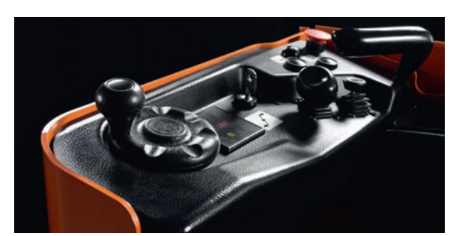
The LSE200's 180° steering makes it easy to drive

The forks on the LSE200 have bogie wheels and can be elevated to 235 mm. This makes it ideal for handling roll cages and work on gradients and uneven surfaces.